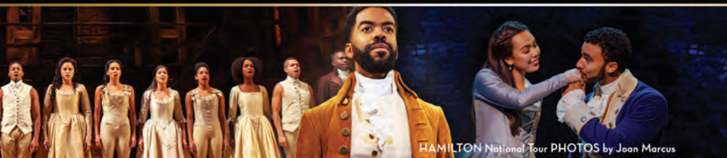
HAMILTON National Tour