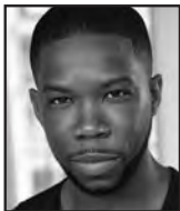
Sir Brock Warren