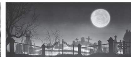
Graveyard with Full Moon - ES7947