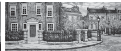
Cherry Tree Lane - S3508