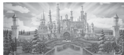
Queen of Hearts - ES8056