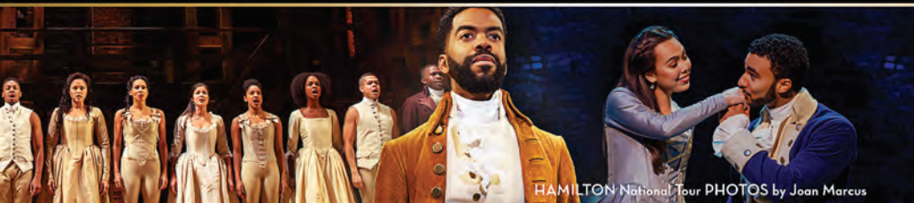
HAMILTON National Tour