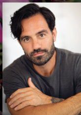
Ramin Karimloo Tony Award® Nominee