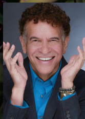
Brian Stokes Mitchell Tony Award® Winner