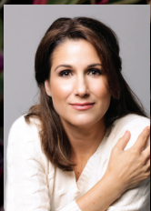
Stephanie J. Block Tony Award® Winner