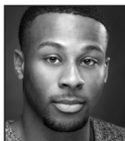
AVILON TRUST TATE