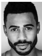
DIMITRI JOSEPH MOÏSE