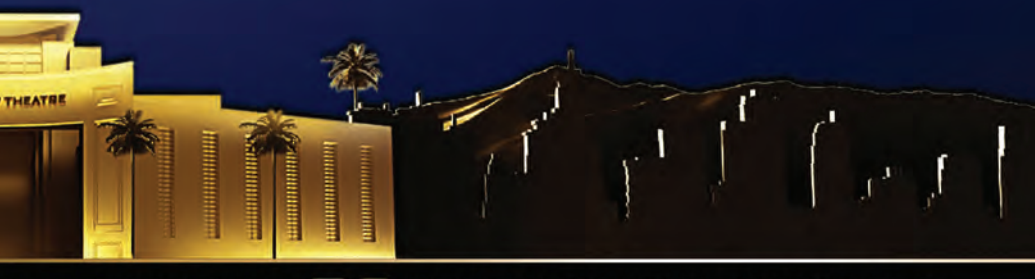
JUL 7 - 26, 2020