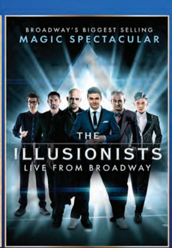
APR 14 - 19, 2020